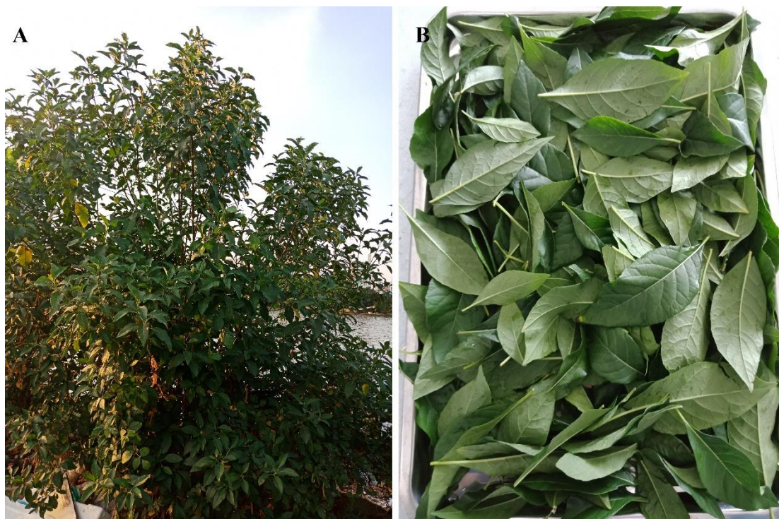
Figure S1: The bitter leaves were harvested from Xuyen Moc district, Ba Ria–Vung Tau province, Vietnam. (A) The leaves of the bitter leaf were harvested from Xuyen Moc, Ba Ria – Vung Tau and identified at VNU-HCM University of Science, Vietnam. (B) The leaves after being washed, drained and divided evenly into stainless steel trays for oven-drying.

Quan, N., Ly, B., & Chi, H. (2023). The cytotoxic effect of Vernonia amygdalina Del. extract on myeloid leukemia cells. Biomedical Research and Therapy , 10(8), 5855-5863. https://doi.org/10.15419/bmrat.v10i8.827